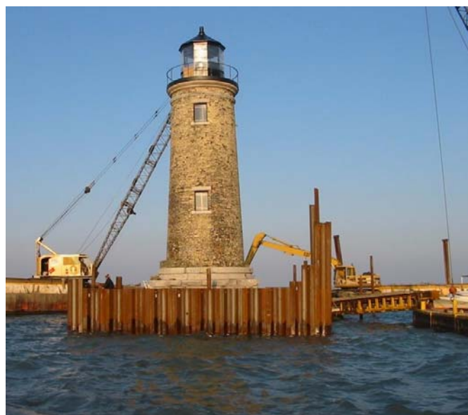
The rear light is protected with 272 feet of seawall and the restored lantern room perched on top.