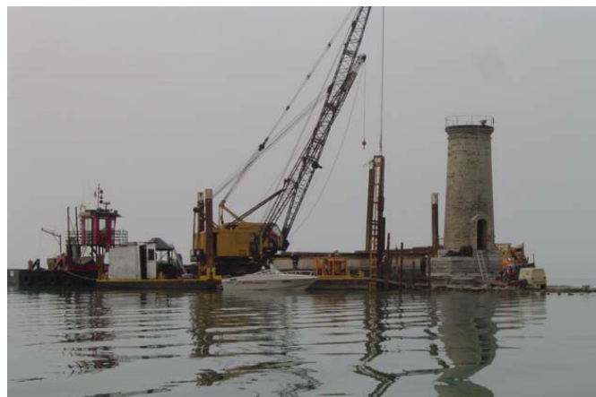
Seawall construction begins around the rear light.

S.O.S. Channel Lights P.O. Box 15 Harsens Island, MI 48028