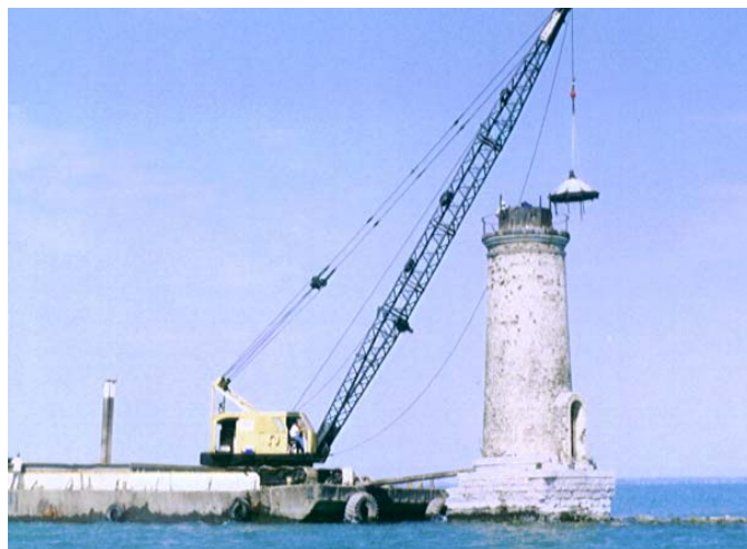
Lantern room being removed in two pieces