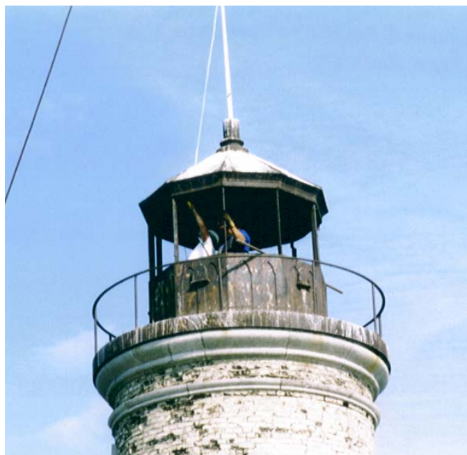
Mihm and Shepard contractors preparing to remove lantern room