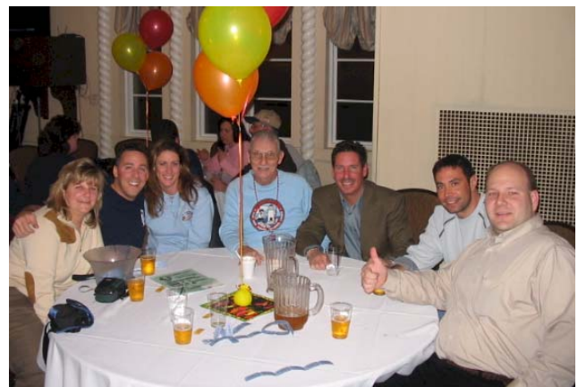
Nautical Mile Chili Cook off raffle crew.

The Nautical Mile Merchants Association was a complete success. The 50/50 raffle raised $159 for the Save our South Channel Lights organization. Visit the NMMA web site at www.nauticalmile.org .